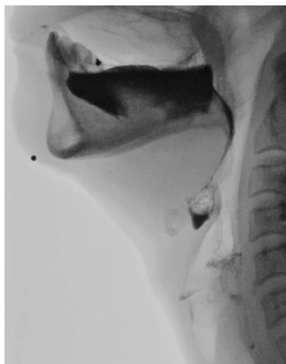
HD patient with poor oral control, spilling and residue in the valleculae

More than 30 HD patients with dysphagia were treated using the Masako and Mendelsohn maneuver. For one specific patient a video was made to make a report of her swallowing progress.