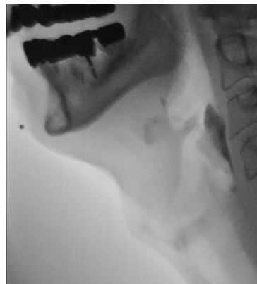
HD patient with solid food residue in the piriform sinus